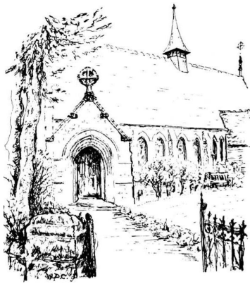
ST AGNES', WEST KIRBY